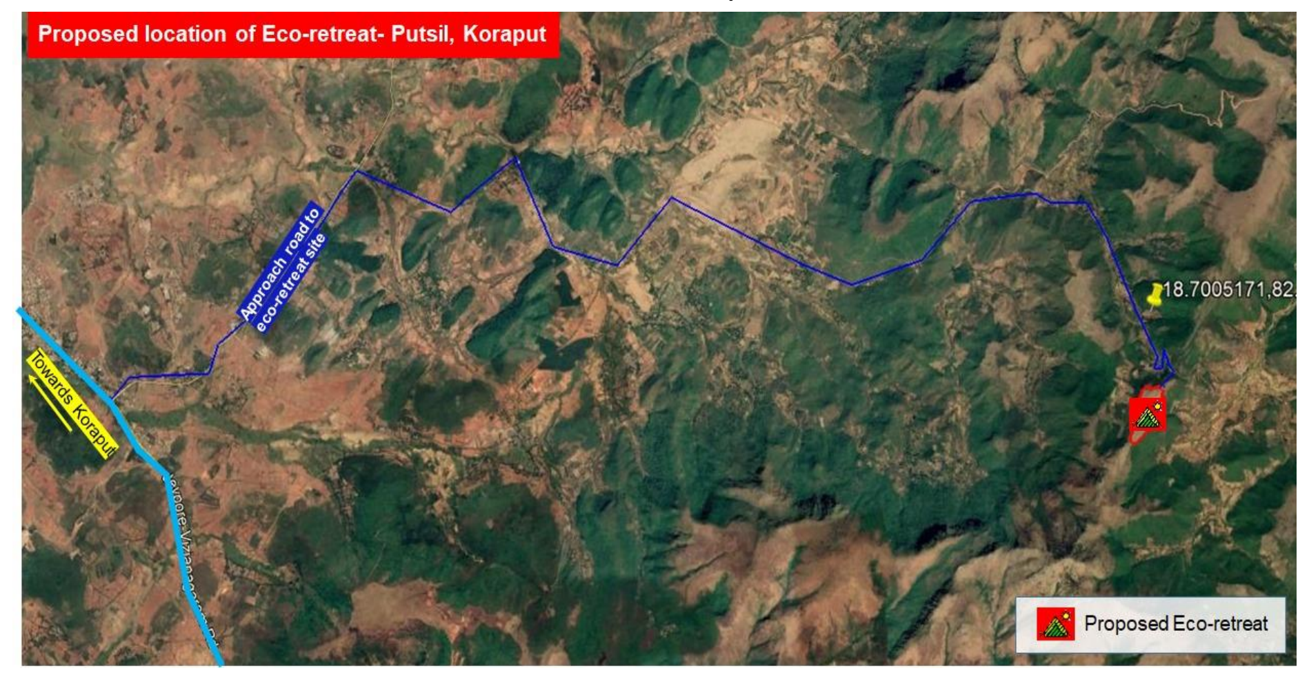
Site 7: Putsil, Koraput