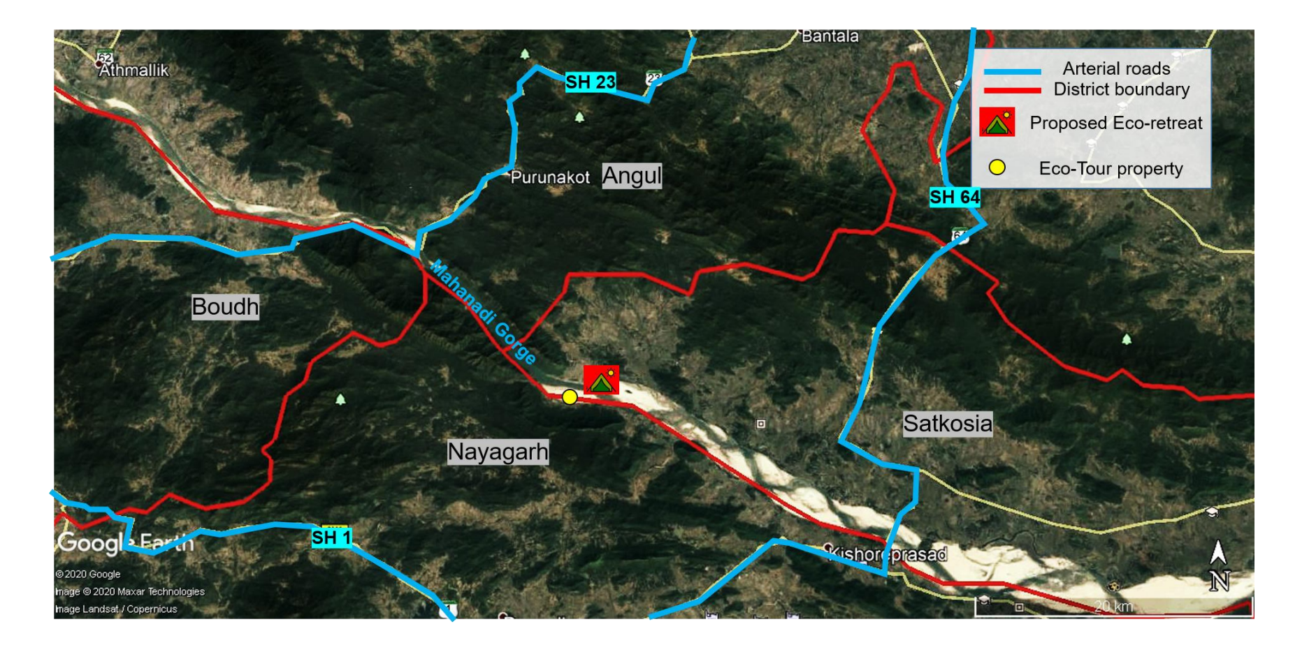
Site 2: Baliput, Satkosia

Selection of agency(s) for set up, operation and management of Eco Retreats at multiple locations in Odisha for a period of 5 Years (2021-2026)