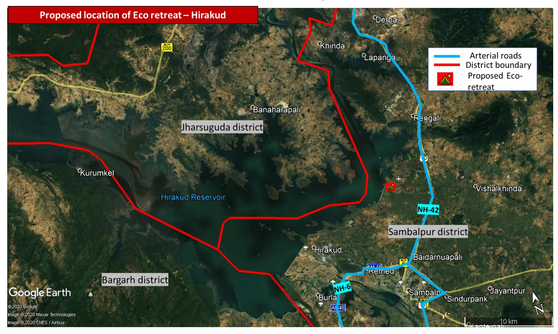
Site 5: Hirakud, Sambalpur